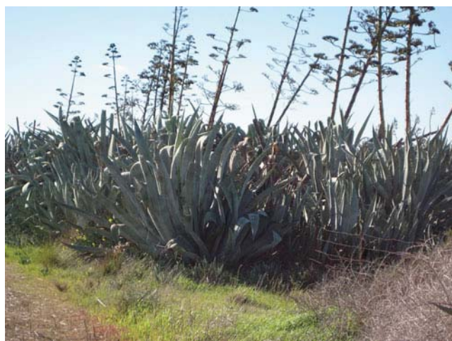
Fig. 2 Photograph taken at an experimental plantation of A. americana in Australia. The biggest agave individuals weighed 1.2 Mg (Arturo Velez, personal communication)

needed to get similar amounts of biomass with poplar (Table 1). Any bioenergy crop under similar amounts of rainfall would be very far from reaching the above-mentioned productivity of A. salmiana , and many of them would even struggle to survive.