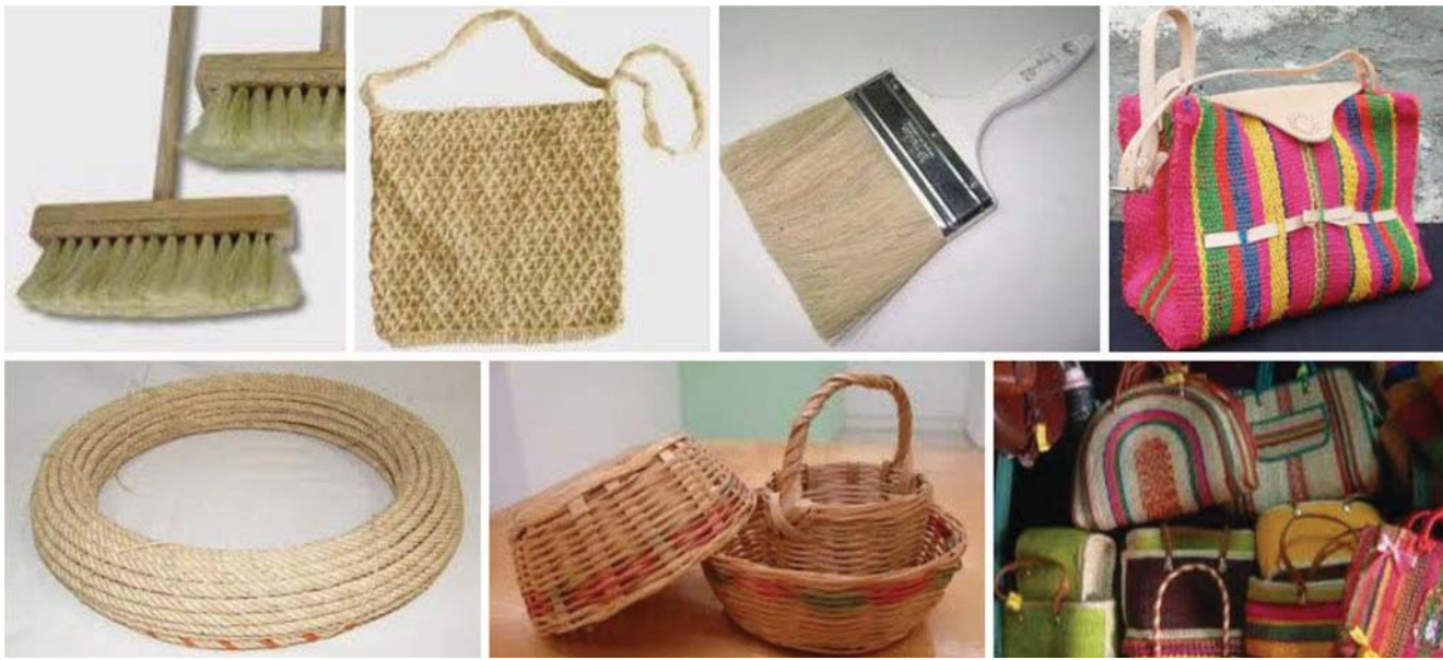
Fig. 3 Mostly artisanal products from Agave fibers (ixtle) now remain in the market

manipulating cell wall polymers [6, 16, 22], or enhancing specific valuable by-product levels.